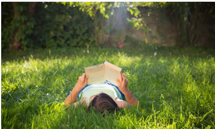
'Multiple studies show that digital screen use may be causing a variety of troubling downstream effects on reading.'

Karin Littau and Andrew Piper have noted another dimension: physicality. Piper, Littau and Anne Mangen's group emphasize that the sense of touch in print reading adds an important redundancy to information - a kind of "geometry" to words, and a spatial "thereness" for text. As Piper notes, human beings need a knowledge of where they are in time and space that allows them to return to things and learn from re-examination - what he calls the "technology of recurrence". The importance of recurrence for both young and older readers involves the ability to go back, to check and evaluate one's understanding of a text. The question, then, is what happens to comprehension when our youth skim on a screen whose lack of spatial thereness discourages "looking back."